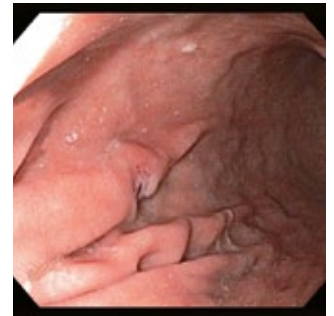
After biopsy removal